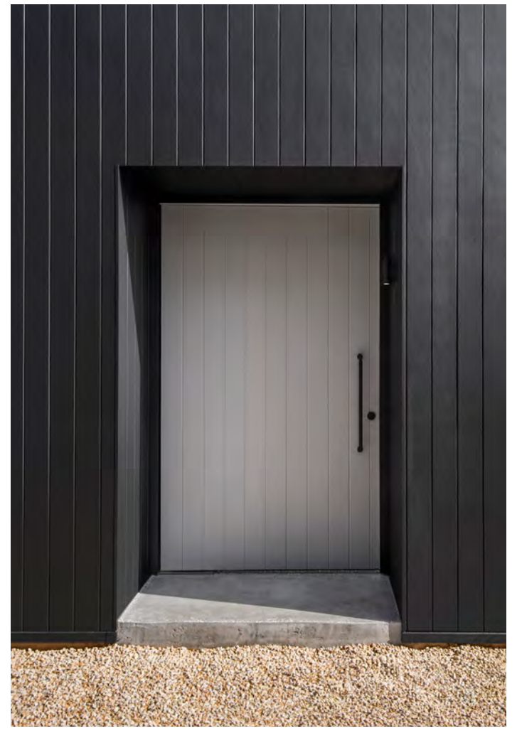
Berlin Pull Handle 600mm – Nero 0483. Architect: Atelier Bond