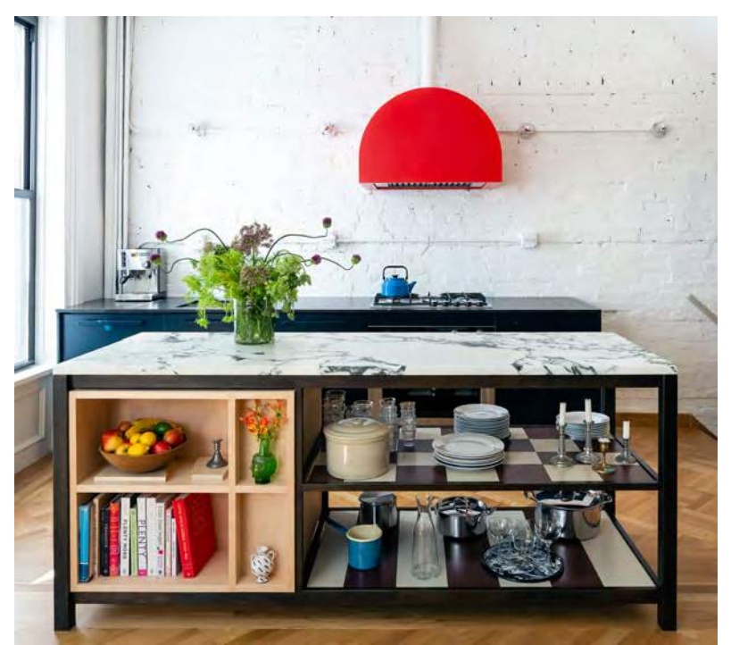
Building & Interior Design: Civilian, Photographer: Brian W. Ferry—