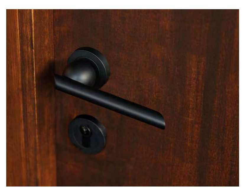
Futurismo Lever on Round Rose – Nero 20693. Architect: Sans-Arc Studio