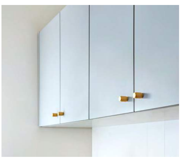
Berlin Cupboard Knobs – Brushed Champagne 0601—