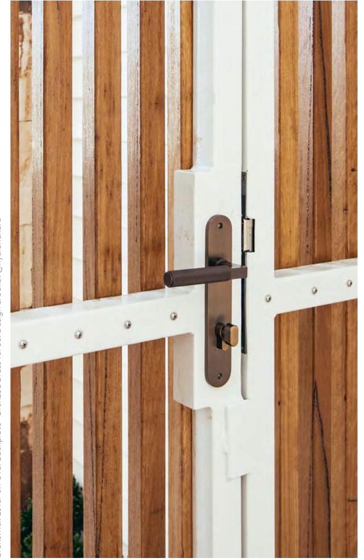
Brunswick Lever on Oval Backplate - Branzed Brass 10768. Design & build: @kyalandkara—