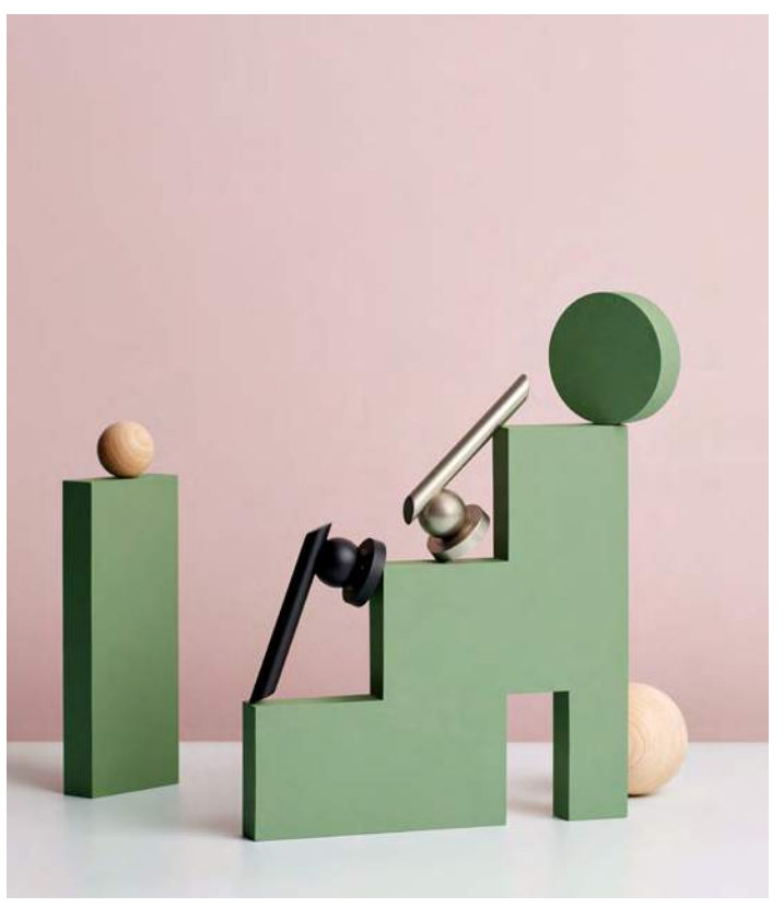
Futurismo Lever on Round Rose - Nero 20693 / Smooth Nickel 20699-