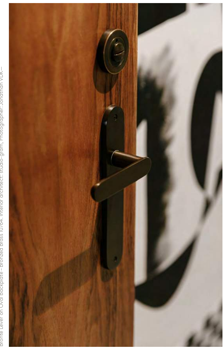
Bronte Lever on Oval Backplate - Bronzed Brass 10764. Interior architect: studio-gram