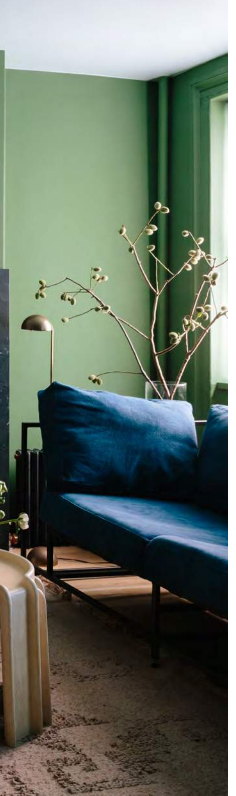
Zzzigurat Knob on Oval Backplate – Nero 12888. Building & Interior Design: Civilian, Photographer: Brian W. Ferry—