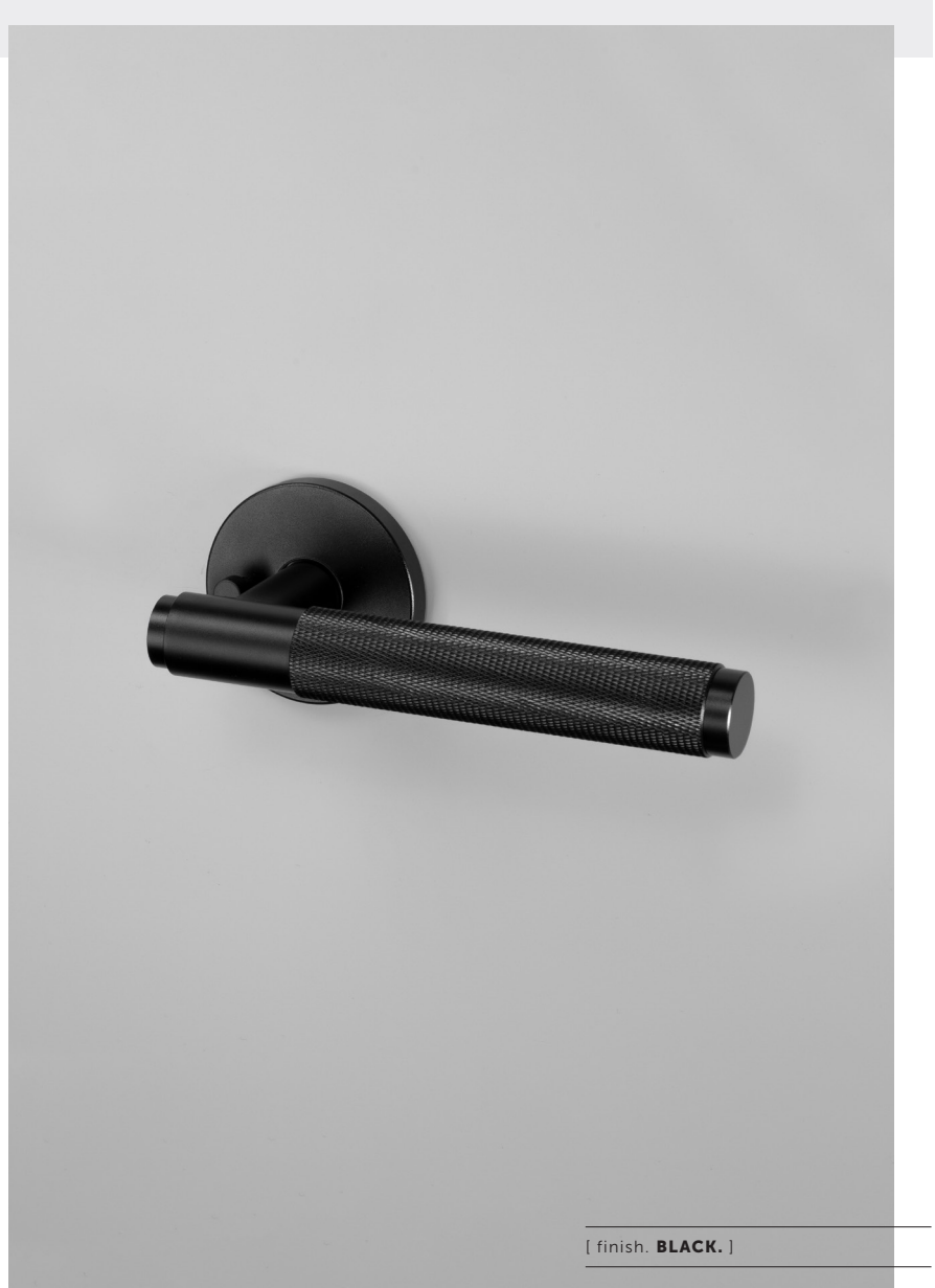
*All images are of the 8 mm thick sprung Door Handle Rose.