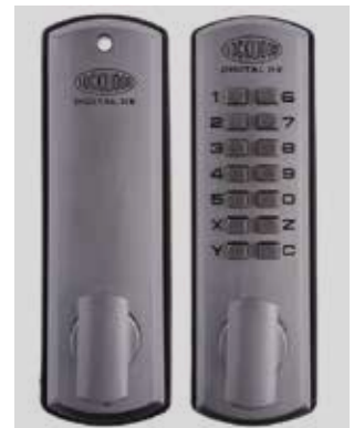
↑ Digital locks are easily programmable and full instructions are included.