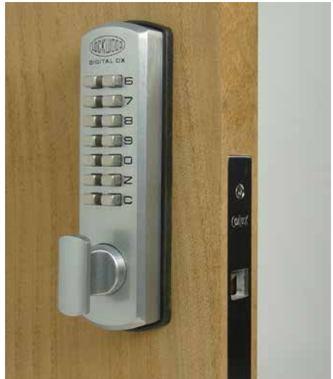
↑ CL100 DigiLock fitted to a timber veneer door.