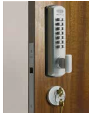
↑ CL100 DigiLock with key locking fitted to a timber veneer door.