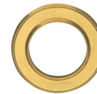
Shown in PB