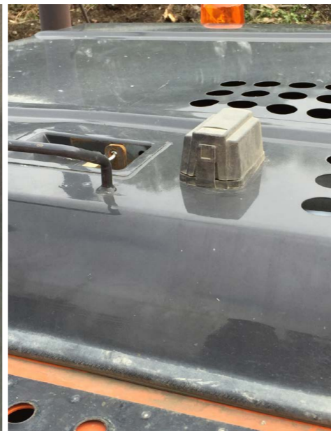
^ 1336-BLK Shown fitted to construction equipment, with supplied rubber cover installed.