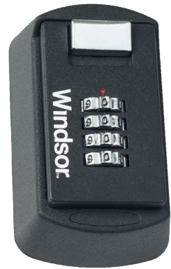
1336 Standard Key Box