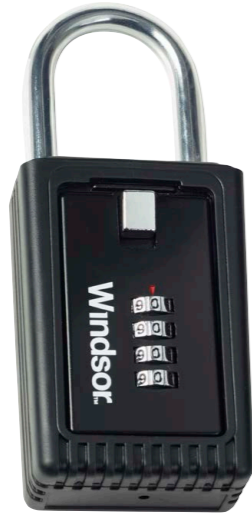
1337 Key Box with Hoop