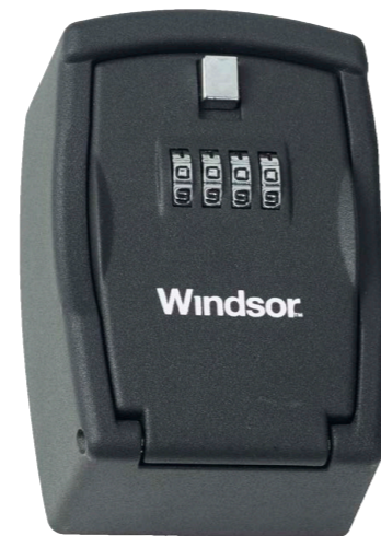
1338 Heavy Duty Mini Safe