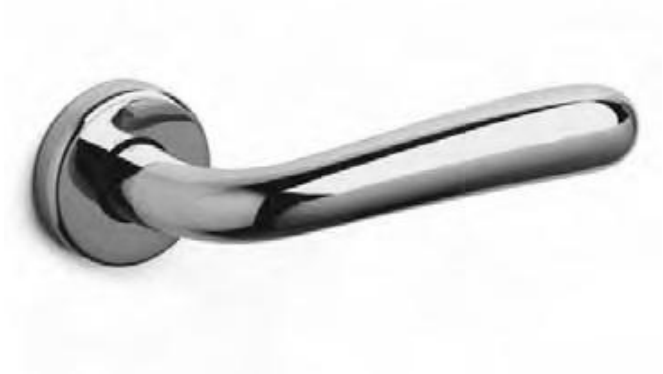
Bond - M163