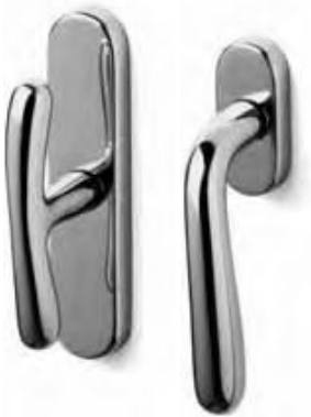
C163R - fixed window slider