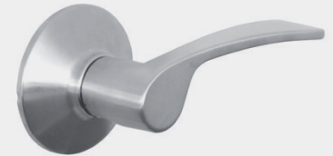
Merano SCP, SNP