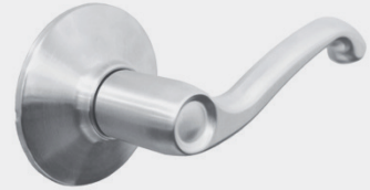
Flair PB, SCP