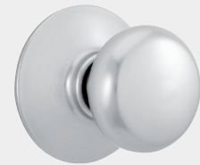
Plymouth PB, SCP, SNP