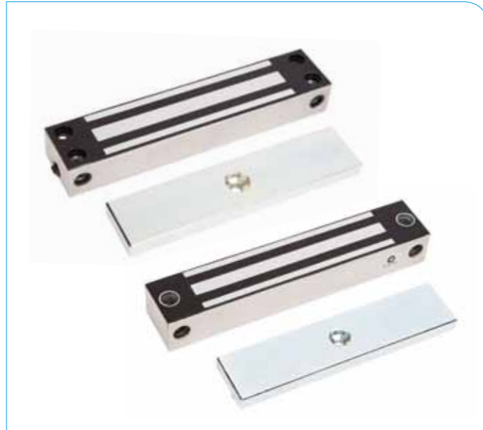
FEM4700FS-LSS | FEM4500FS-RSW

NEW GENERATION ELECTRIC AND ELECTRONIC LOCKING FISH www.fishlocking.com.au